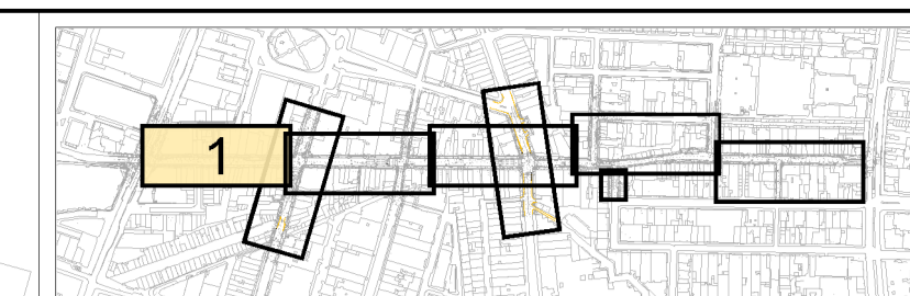
SHEET KEY PLAN