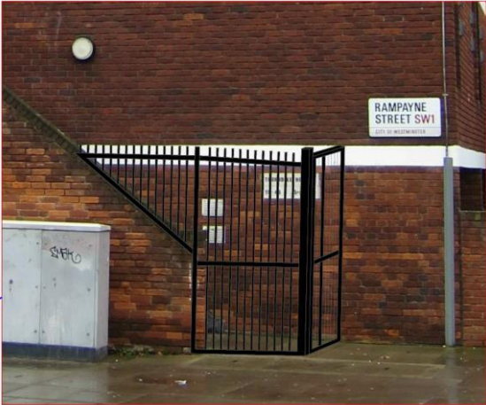
Proposed Gate No.1