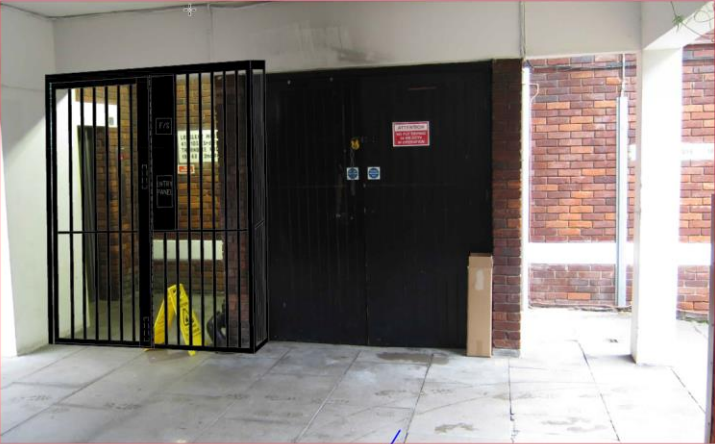
Proposed Gate No.2