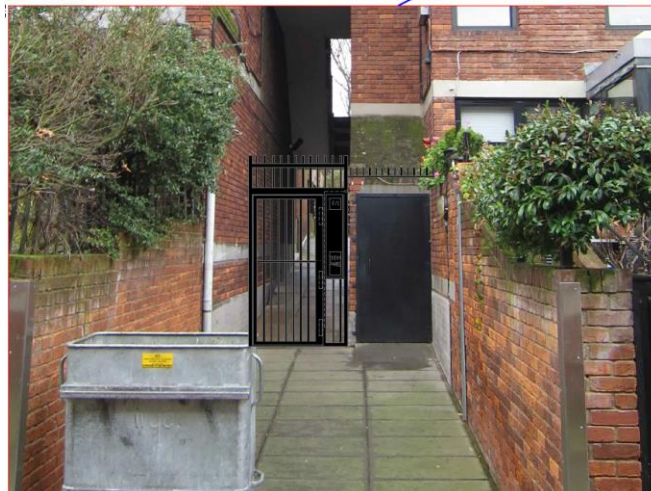
Proposed Gate No.7