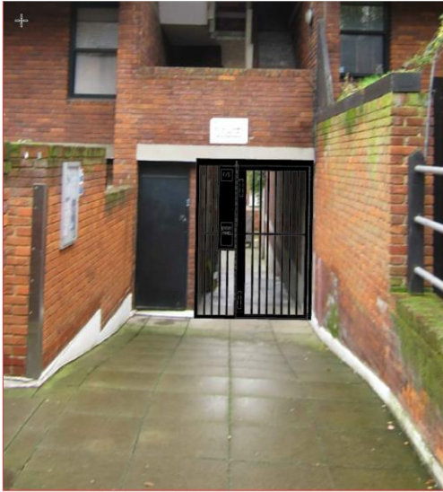
Proposed Gate No.4