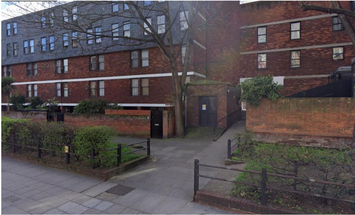
Thorndike House from Vauxhall Bridge Road (Gate 2 location)