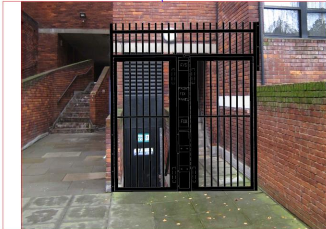
Proposed Gate No.6