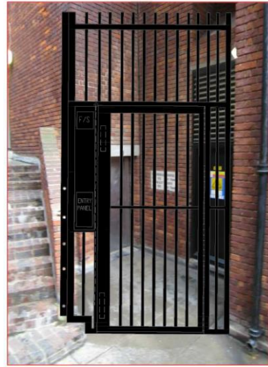
Proposed Gate No.5