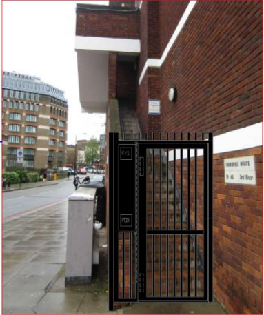
Proposed Gate No.1