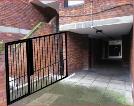
Proposed Gate No.3