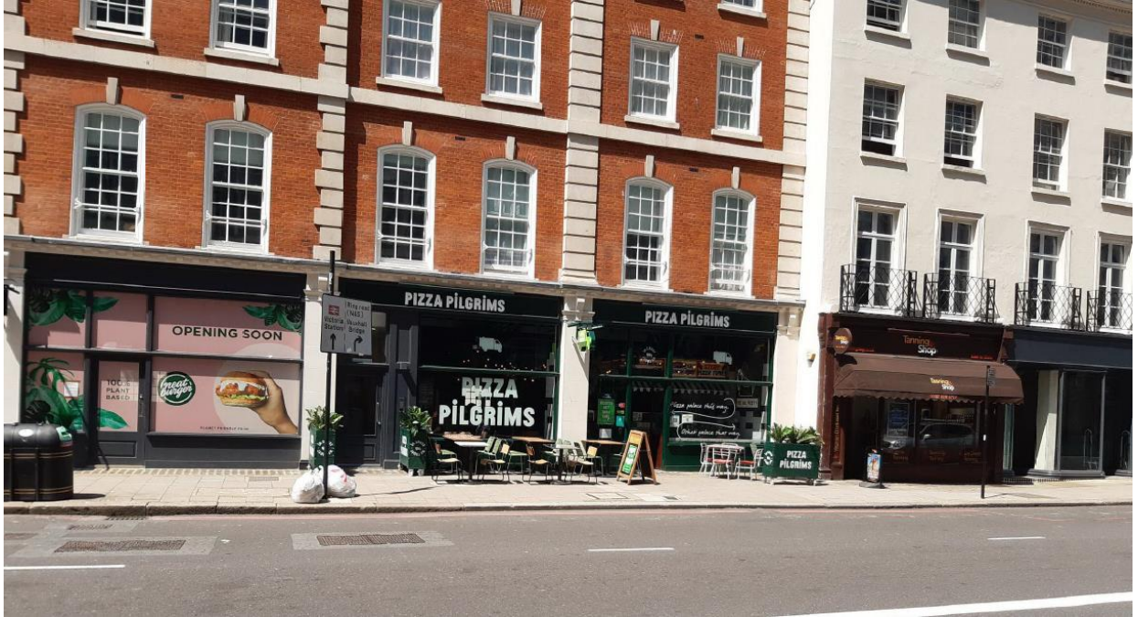
Front Elevation of Application Site